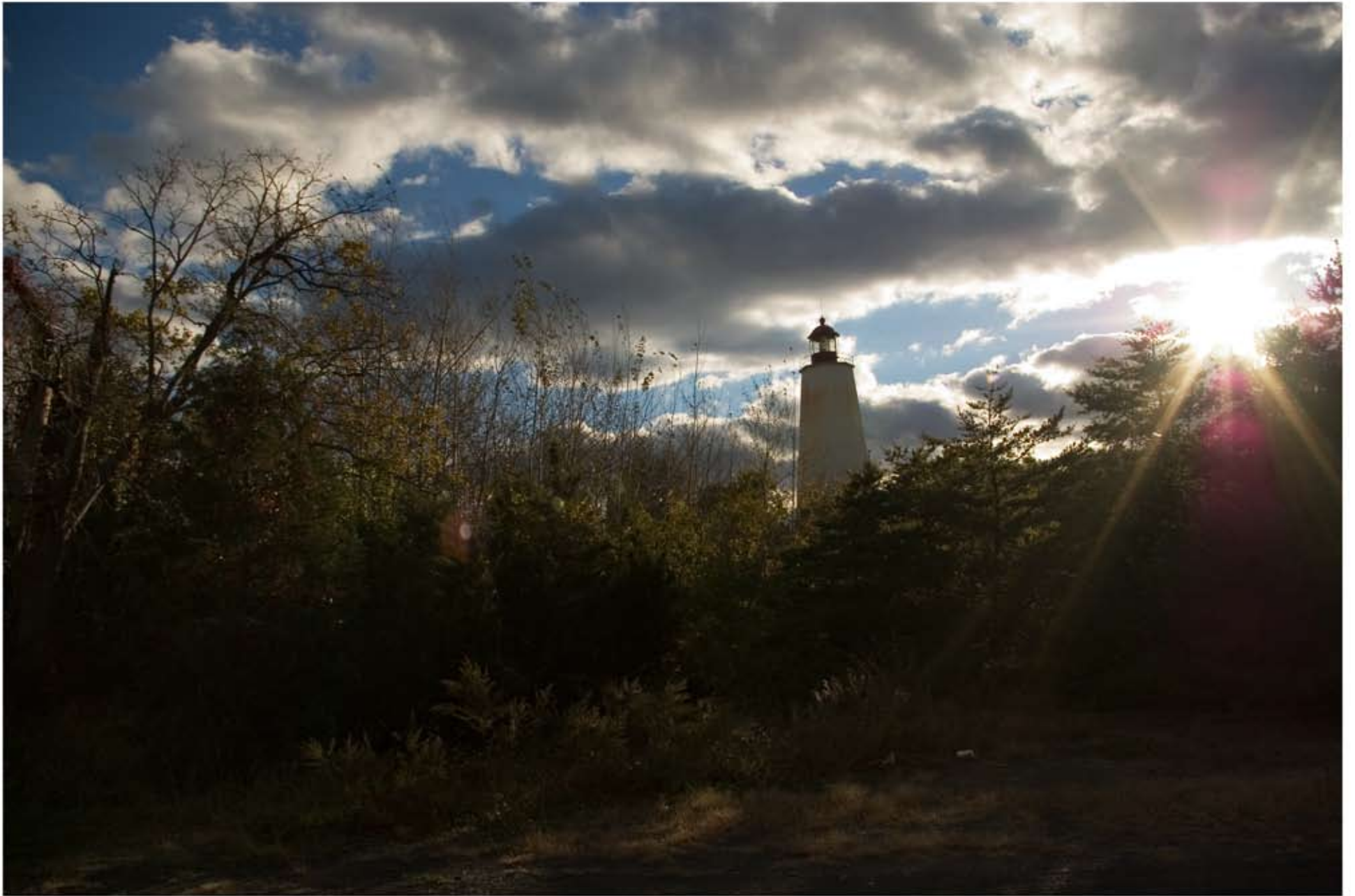
Sandy Hook Light 3