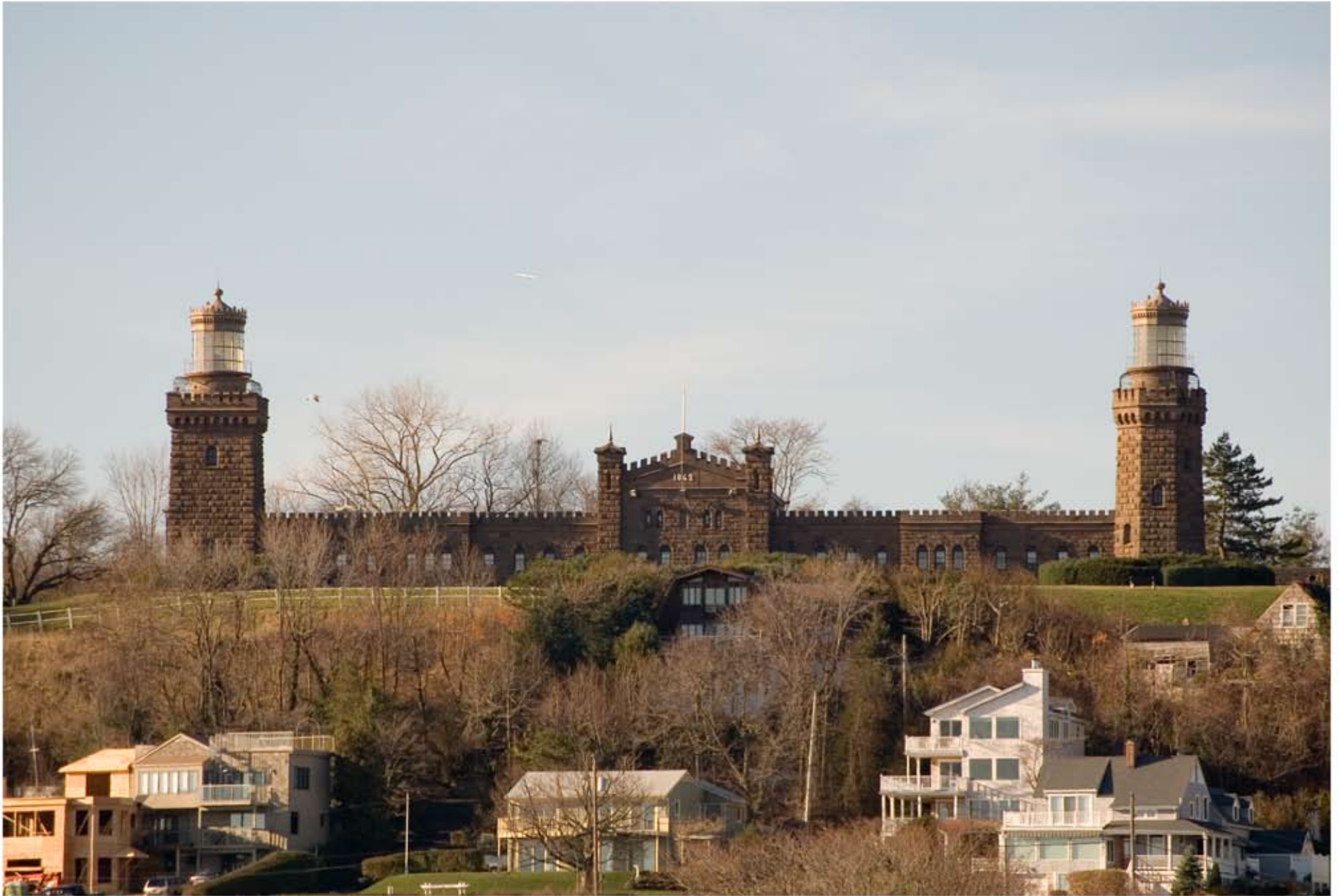
Twin Lights at Navesink