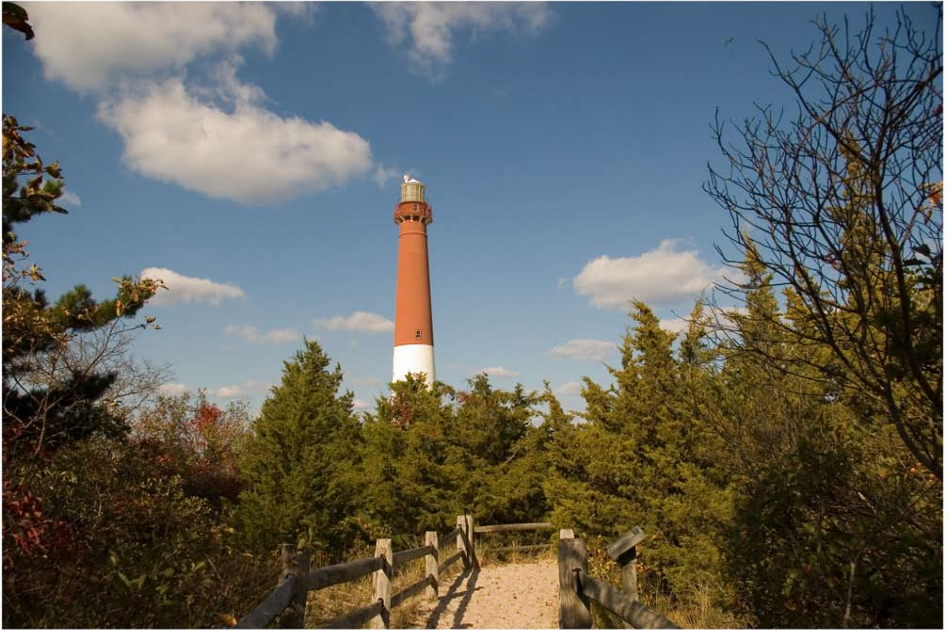
Barnegat Light 10