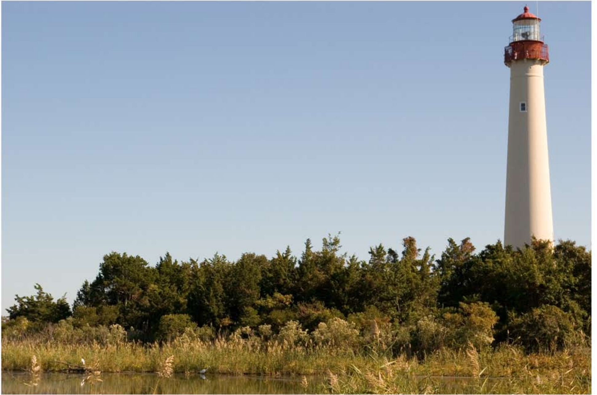
Cape May Light 19