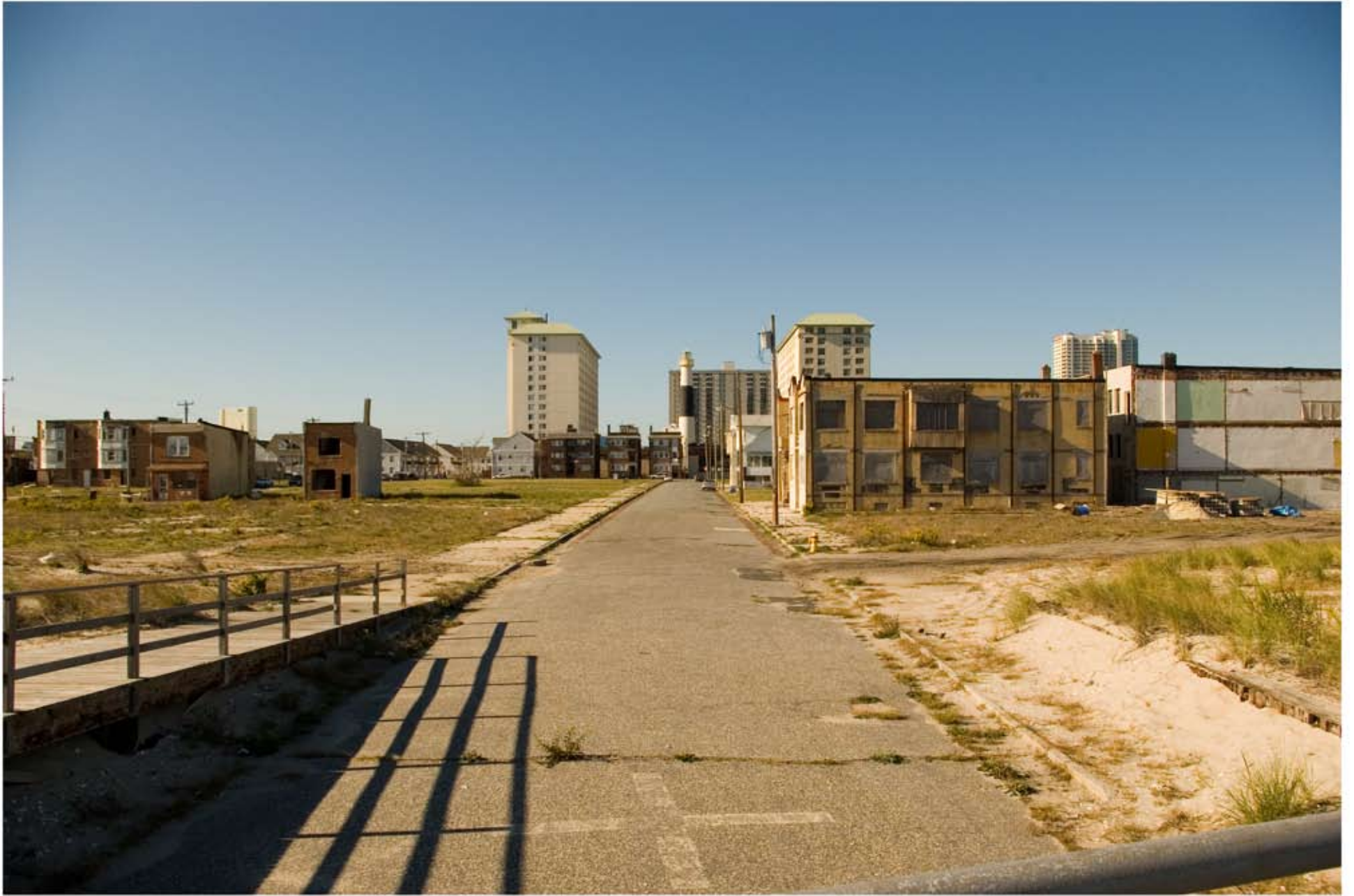
Absecon Light (Atlantic City)