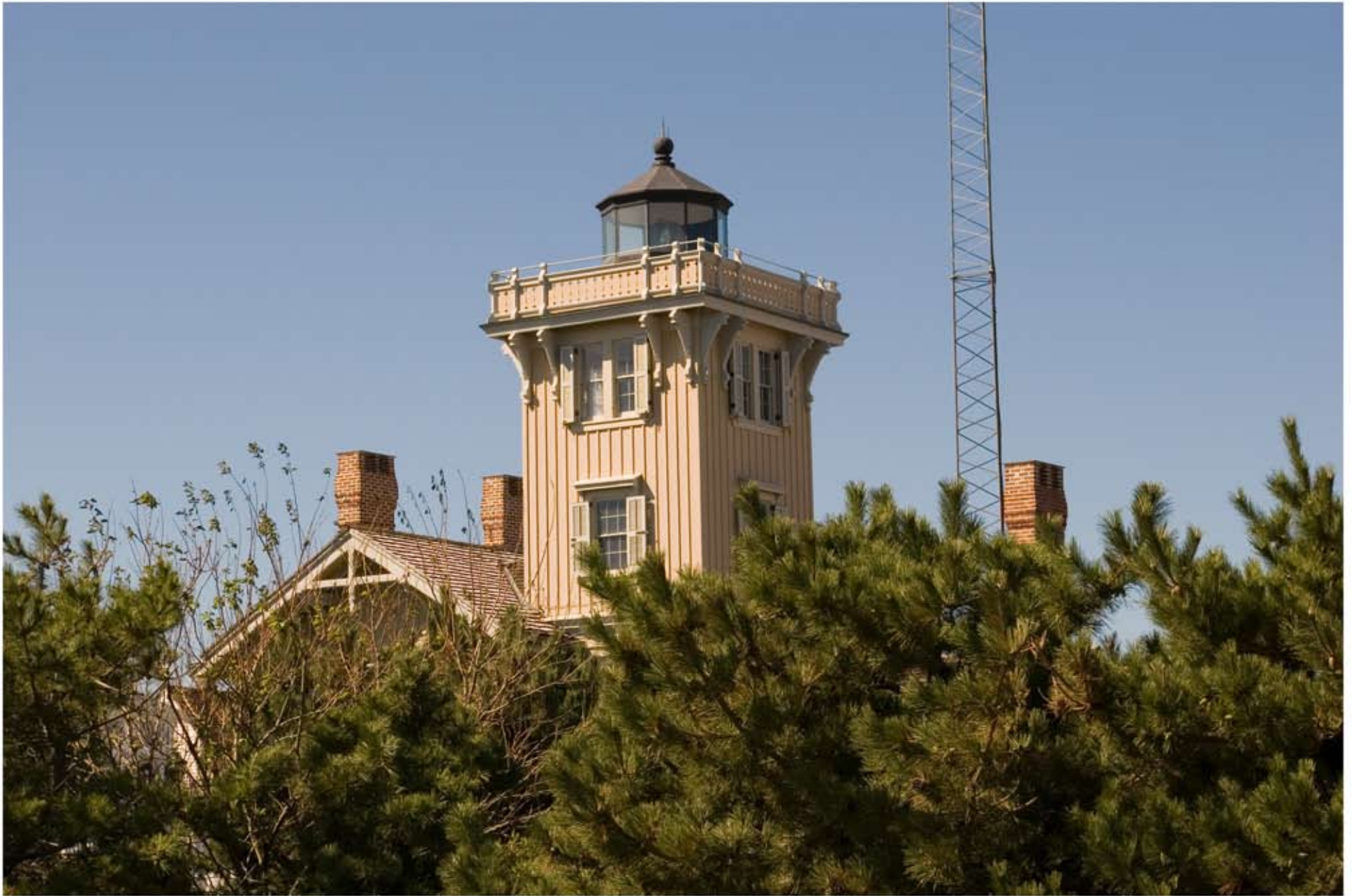
Hereford Inlet Light 17