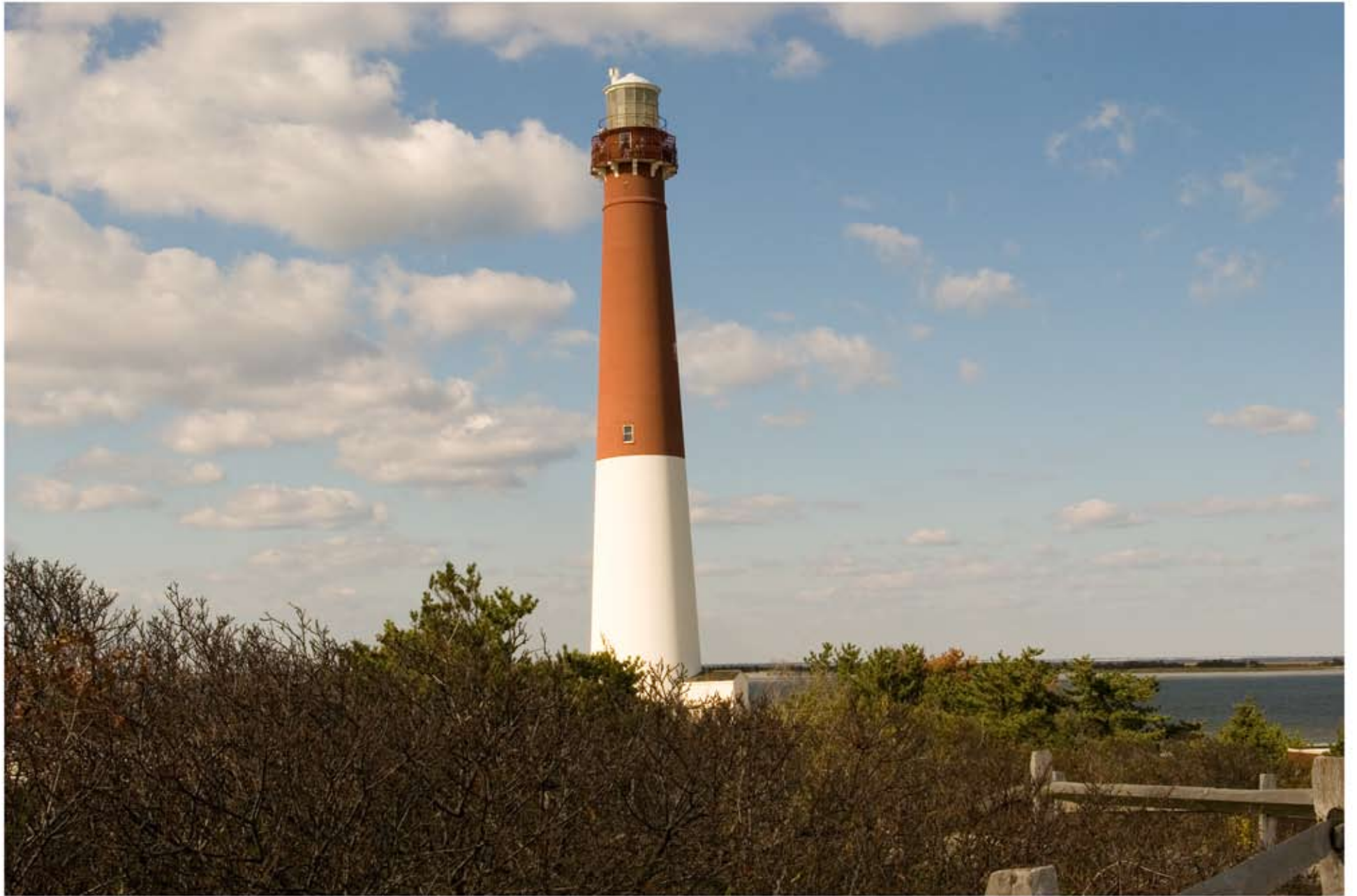
Barnegat Light 9