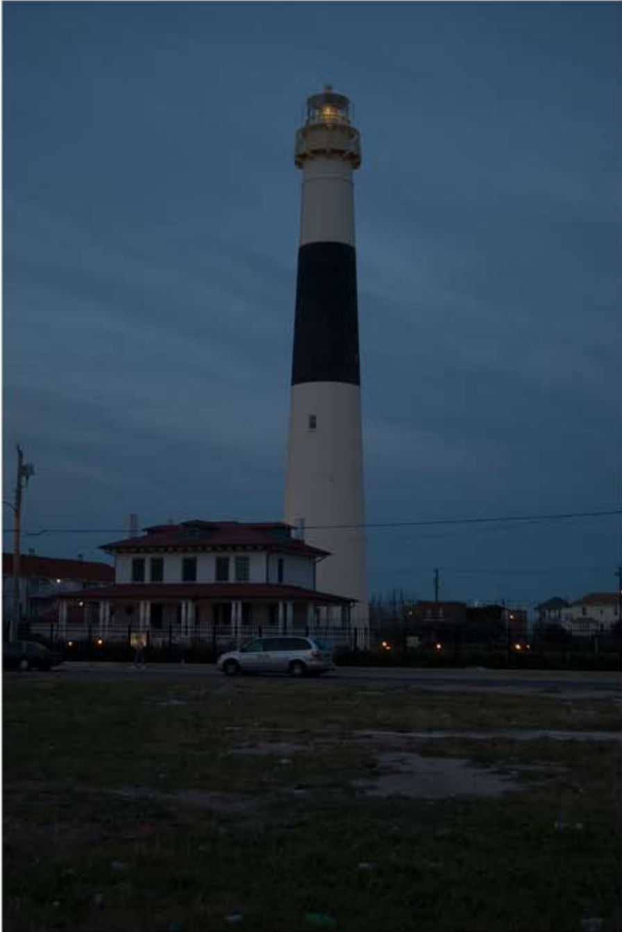
Absecon Light (Atlantic City)

The light was decommissioned in 1933, and was again relit in 1999.