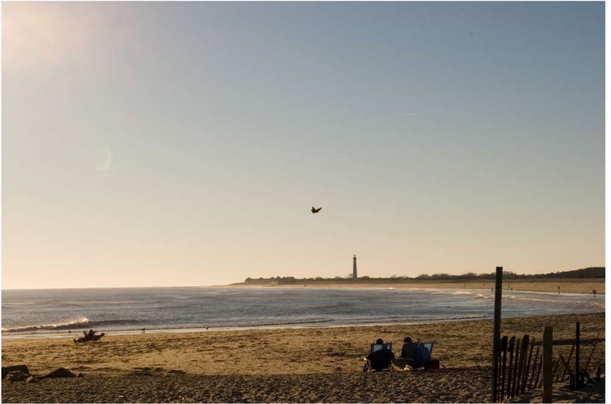
Cape May Light 20