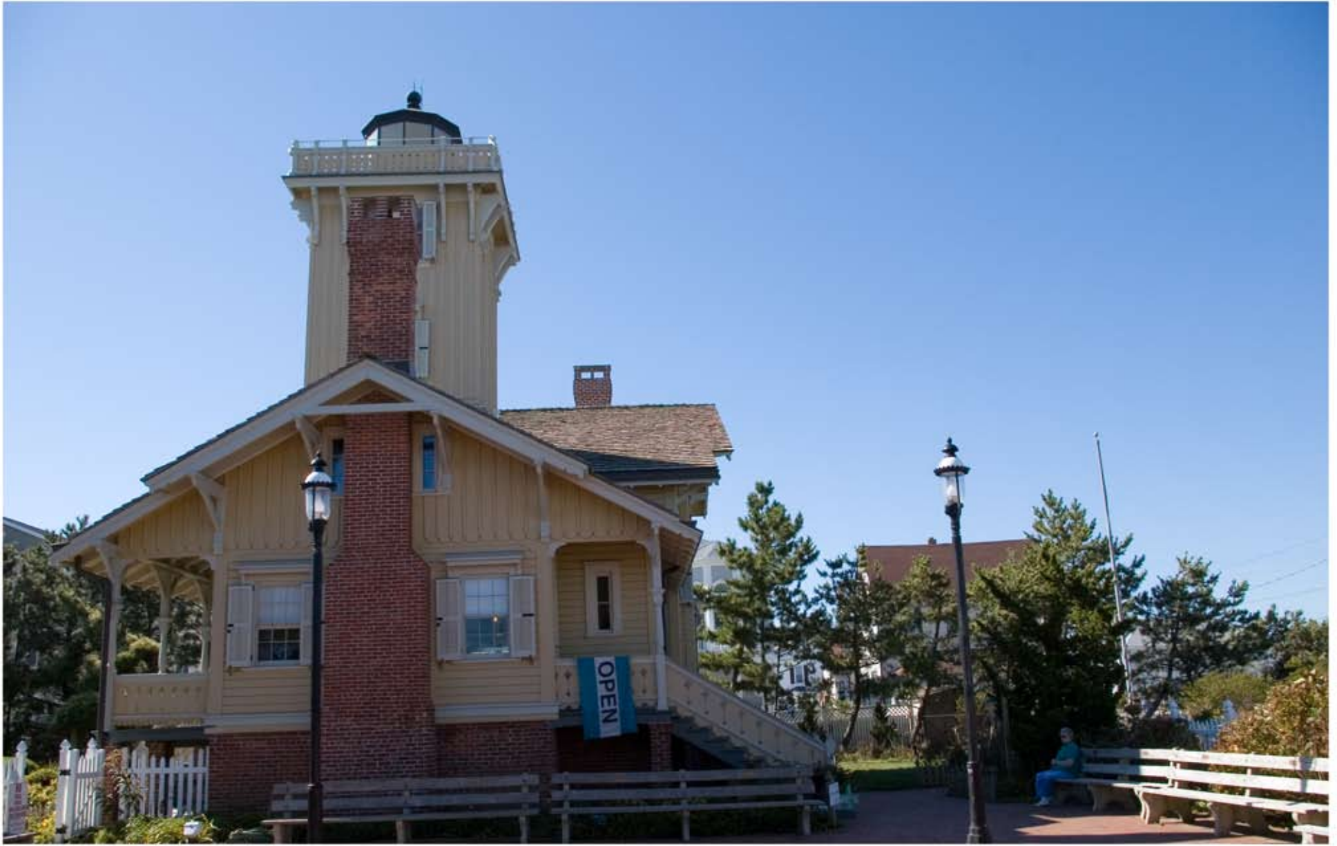
Hereford Inlet Light 16