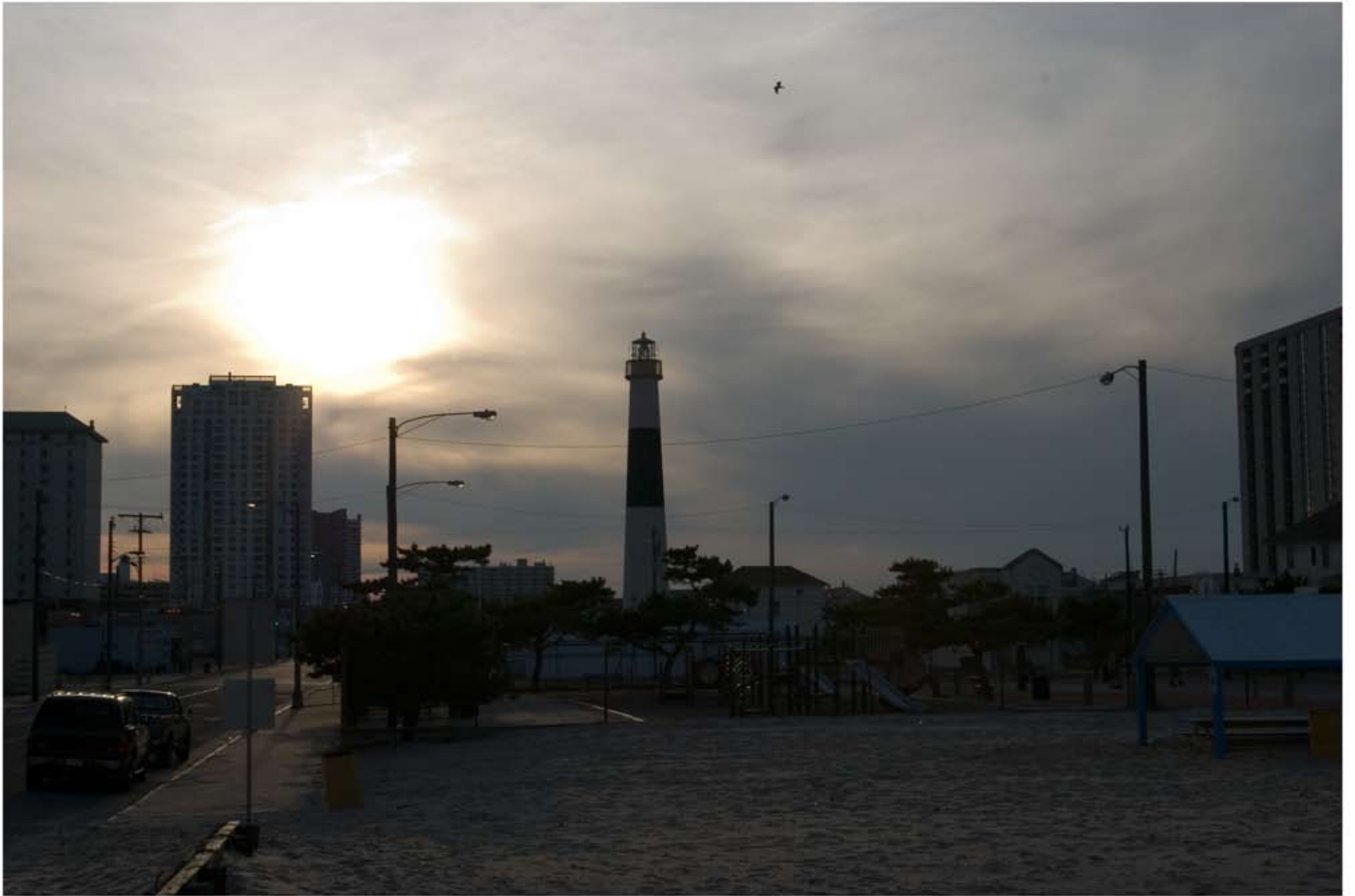
Absecon Light (Atlantic City) 13