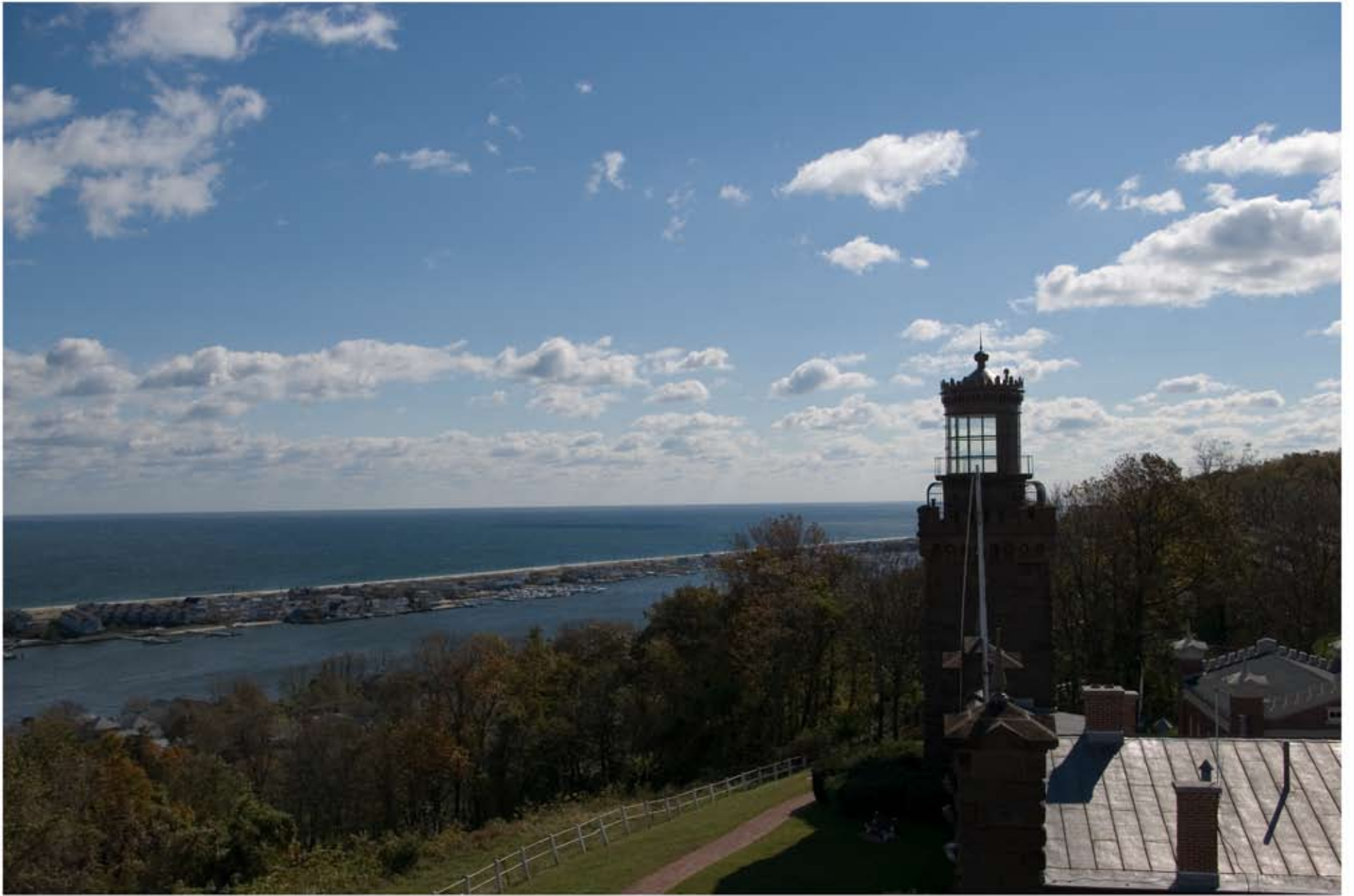
Twin Lights at Navesink 7