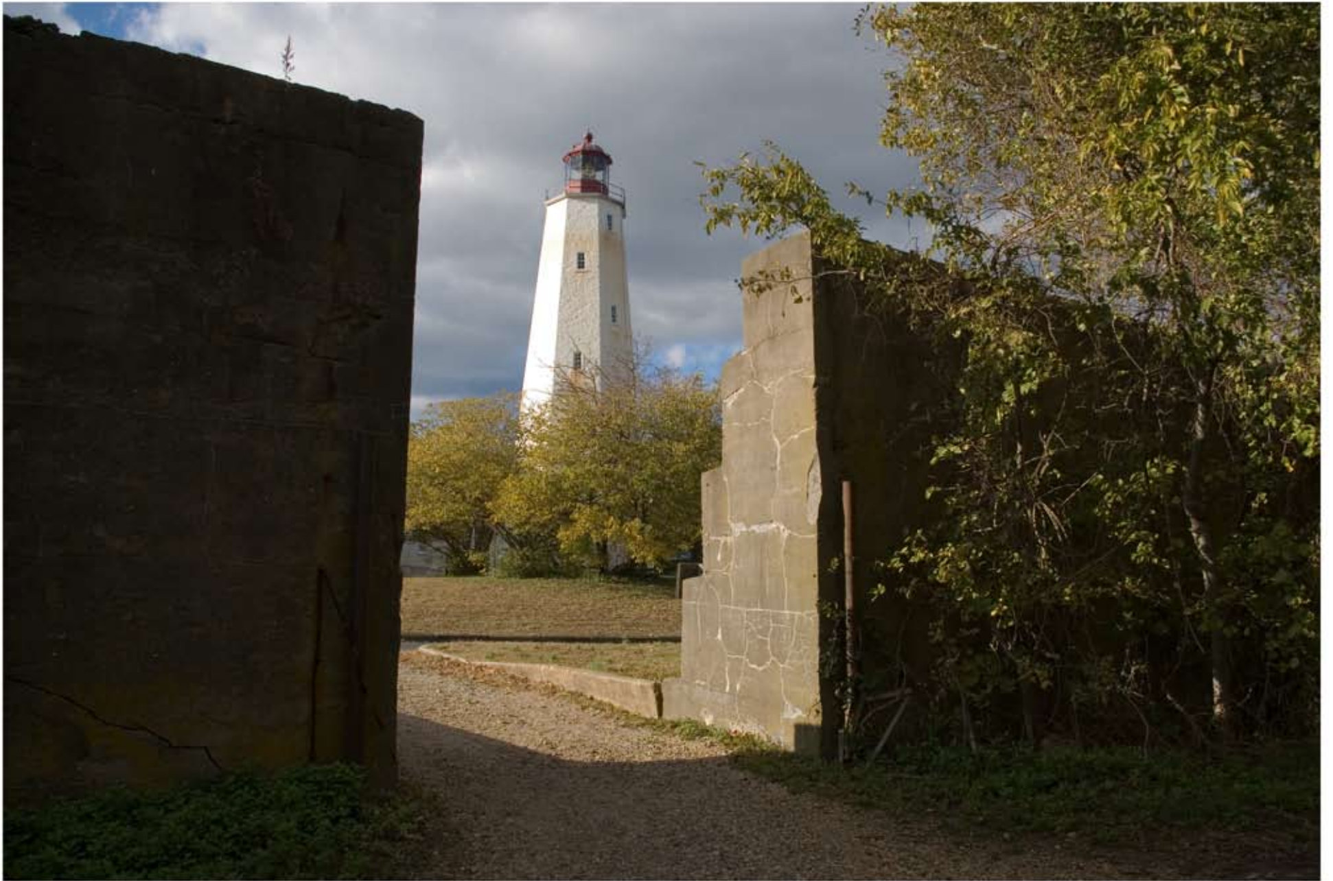
Sandy Hook Light 1